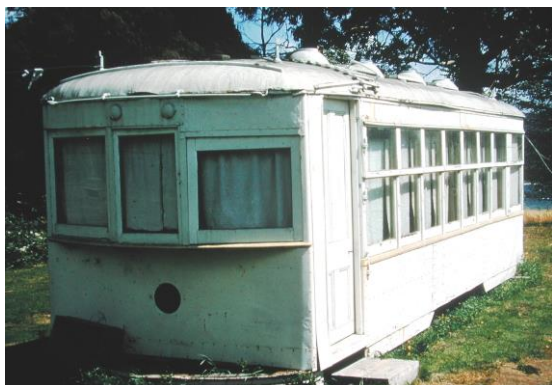
Birney 16 in 1960