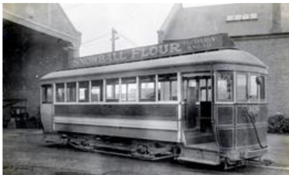
126 as new in 1917

In Christchurch the first of 27 standard 4 wheel trailers, No. 126, built by Boon and Co. in 1917 has been relocated from a farm property on Banks Peninsula to Ferrymead, where for the time being it will remain outside demonstrating its post-tram format as a holiday cottage.