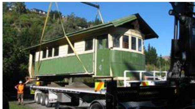
126 on arrival at Ferrymead, May 2016