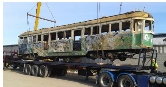
Melbourne SW2 436 on the move March 2016