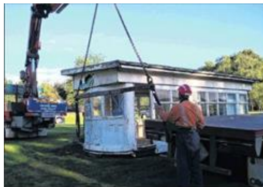
Birney 16 in 2016