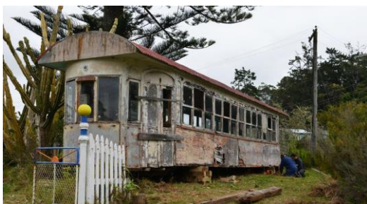
Auckland No. 235 at Dargaville 2015